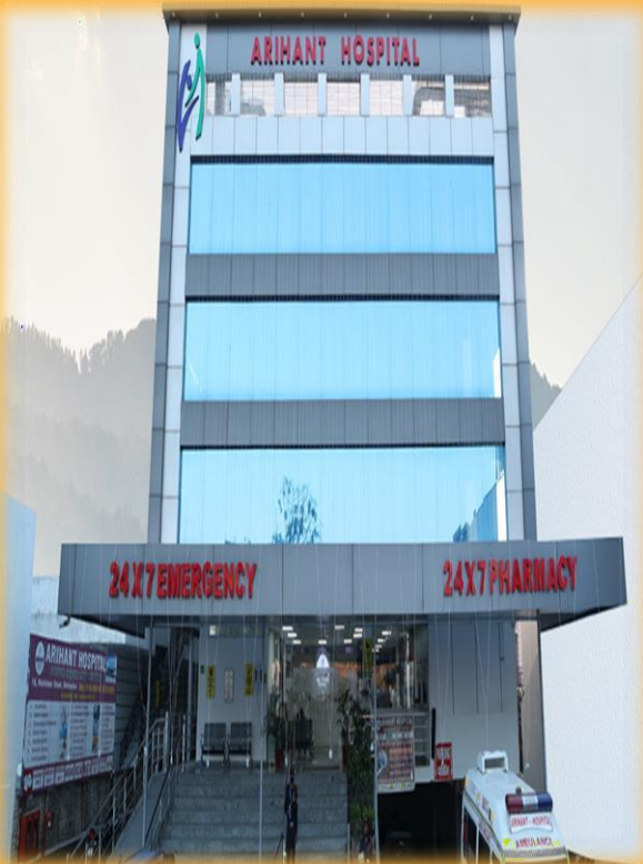
Arihant Hospital Healthcare Partner