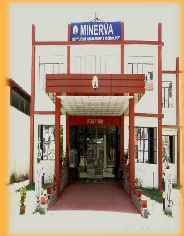
Minerva Group of Institutions Research & Training Partner